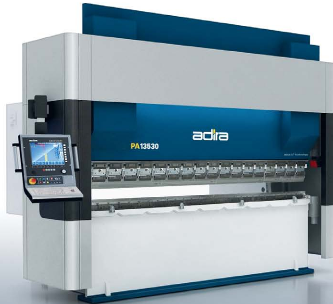
Fast | Flexible | Accurate | Sustainable PA 13530 HEXA C®