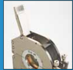
"Flip-top" hinges open for final inspection of tube alignment prior to welding.

The 800 Series utilizes two inexpensive insert plates made of a heat/UV resistant material to protect the Head housing and mechanism. If necessary, they can be replaced in minutes.