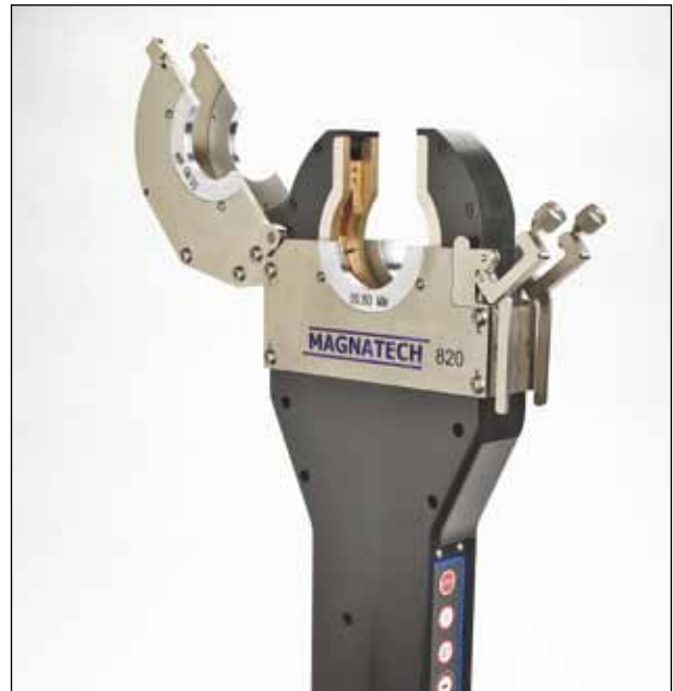
Superior Water Cooling Technology allows true 100% Duty Cycle