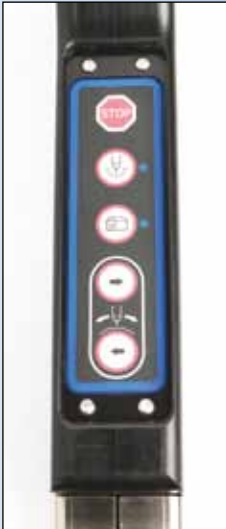
Molded silicone switch panel eliminates need for separate remote pendant. Dirt and moisture resistant.